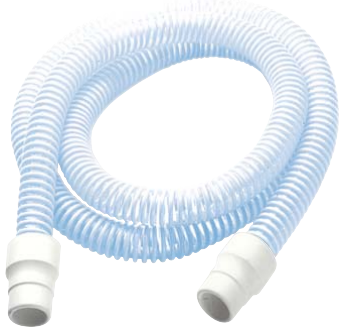
Smooth ID Tubing, Extended Use for Single Patient