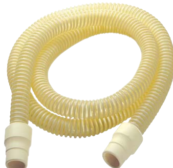
Smooth ID Tubing, Reusable