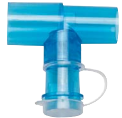
Valved "T" Adapter