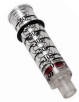
DPM™ Disposable Pressure Manometer