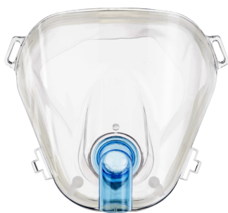
BiTrac MaxShield Mask with 22mm Female Standard Elbow and Reusable Head Strap.