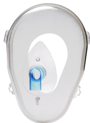
BiTrac NIV Shield with 22mm Female Standard elbow, and Reusable Head Strap.