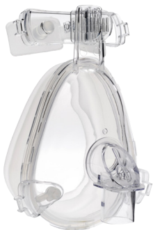
BiTrac NIV Full Face Mask with 22mm Female Anti-Asphyxia Elbow, Silicone Forehead Pad, OmniClip, and Reusable Head Strap.

The BiTrac NIV Full Face Mask offers a double lip cushion seal which allows you to place the mask on a patient's face, without adding pressure, to form an efficient seal. It has an OmniClip™ that allows you to adjust the mask in and out, as well as up and down.