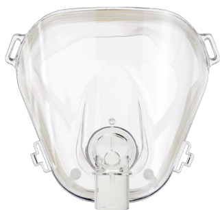
BiTrac MaxShield Mask with 22mm Female Anti-Asphyxia Elbow and Reusable Head Strap.

This MaxShield mask offers a larger perimeter for easier fitting and for use with claustrophobic patients or those patients with facial hair. This mask helps in simplifying the mask fitting process, and when alternated between a full face mask, can help to prevent pressure ulcers.