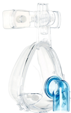
BiTrac NIV Full Face Mask with 22mm Female Standard Elbow, Silicone Forehead Pad, OmniClip, and Reusable Head Strap.