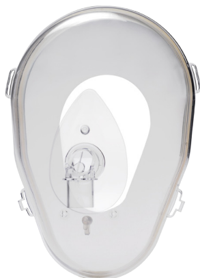
BiTrac NIV Shield with 22mm Female Anti-Asphyxia elbow, and Reusable Head Strap.

This mask offers a full facial perimeter seal in one size to quickly ventilate your patient without going through the mask fitting process. Works well on patients with facial hair or claustrophobia.