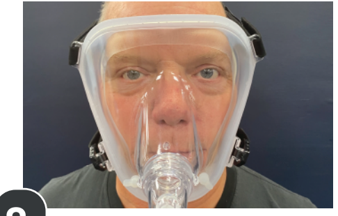
8. Follow these steps again when the mask has been removed or refitting the mask.

Once the top are done, adjust the bottom velcro straps.