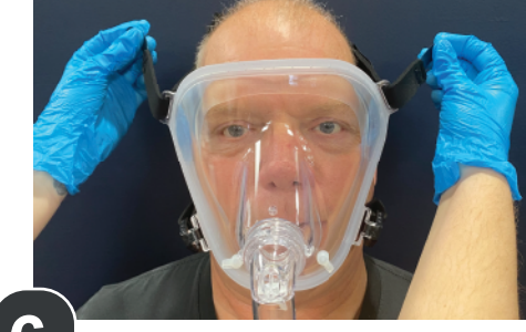
6. Adjust top straps to fit: Do Not Overtighten Head Straps