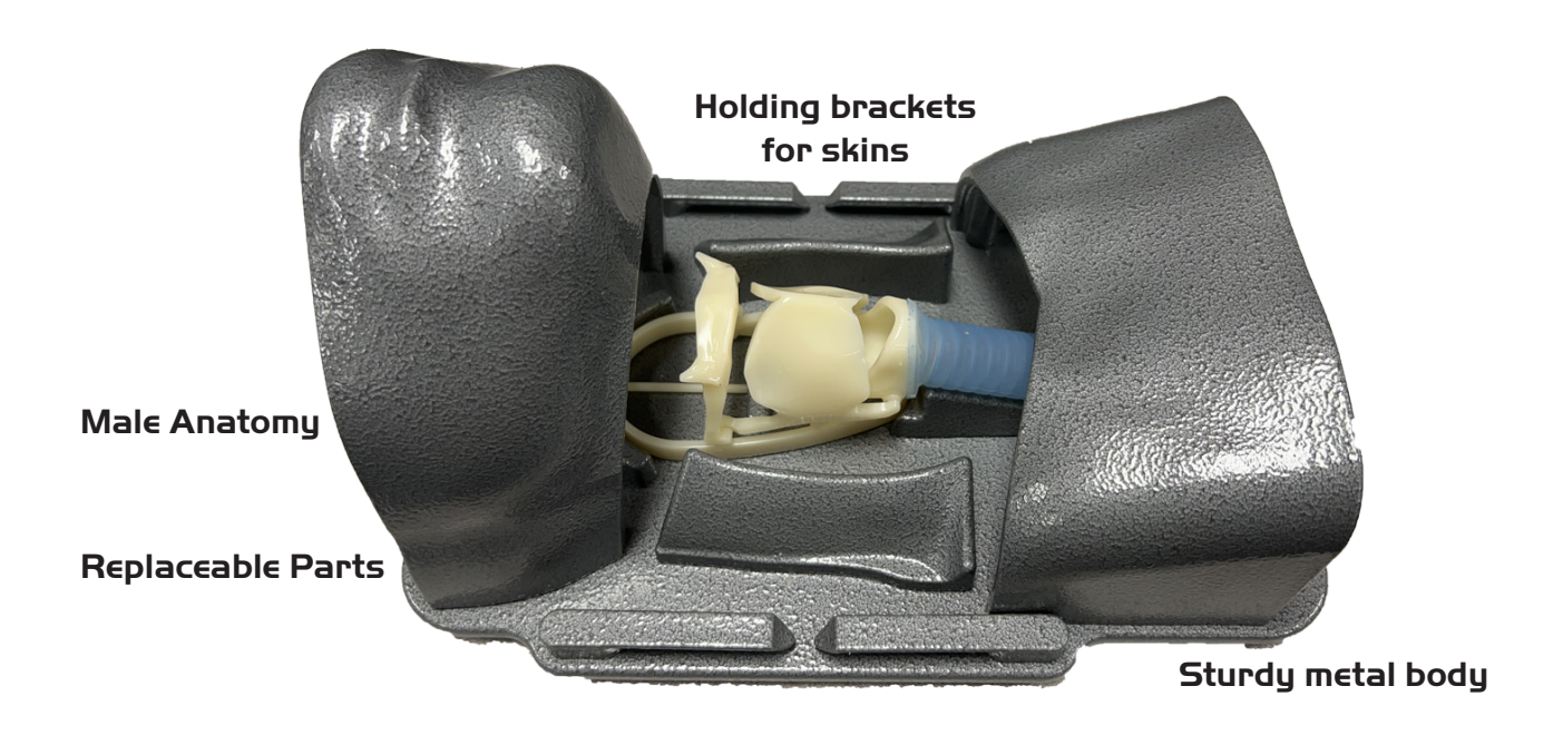
Easily store and transport